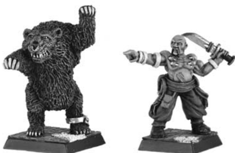
Pack contains one bear and bear tamer